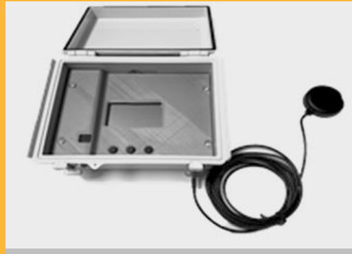
ROGO DROP BLOCK